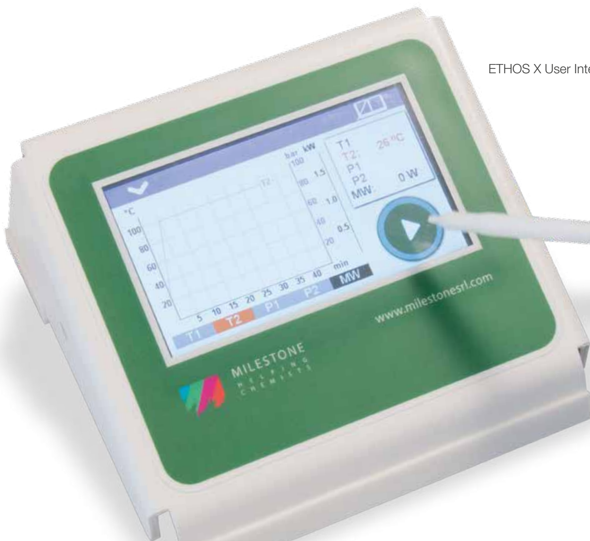
ETHOS X User Interface

USER INTERFACE - The ETHOS X is controlled via a compact terminal with an easy-to-read, bright, full-color, touchscreen display. The terminal is provided with multiple USB and Ethernet ports for interfacing the instrument to external devices and to the local laboratory network. The terminal runs a completely new user-friendly, icon-driven, multi-language software to provide easy control of the microwave run. Simply recall a previously stored method or create a new one, press 'START' and the system will automatically follow the user defined temperature utilising a sophisticated PID algorithm. Several applications, including all US EPA and ASTM methods available, are preloaded in the ETHOS X terminal. There is no need to input the number of samples or weights being extracted, as the software will automatically regulate the microwave power accordingly. This assures a consistent quality of extraction and simplifies the use of the instrument.